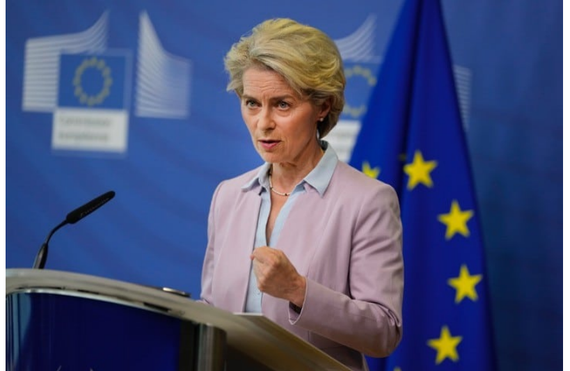
AP Images Ursula von der Leyen

On Wednesday, European Commission President Ursula von der Leyen unveiled the EU's plan to address the worsening energy crisis facing the bloc of nations amid "green" measures meant to address climate change and cutbacks in natural gas deliveries by Russia. The plan includes mandatory electricity rationing and a strict price cap on Russian imports of natural gas. In addition to electricity rationing and price caps on Russian gas exports, von der Leyen called for a cap on excess revenues made by renewables and nuclear energy, a solidarity mechanism to capture the "massive" and "unexpected" profits reaped by fossil fuel companies, and an EU aid program to inject extra liquidity into struggling utility businesses.