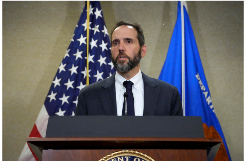
Jack Smith

Smith could proactively withdraw the charges himself, or simply resign and allow the current leaders of the Justice Department to shutter them. He could continue to pursue the cases for the next two and a half months and essentially force Trump, or his appointees, to pull the plug. Or, with [Attorney General Merrick] Garland’s blessing, he could release a comprehensive final report detailing the evidence against Trump — evidence that he never got to show juries because both cases never came close to reaching trial.