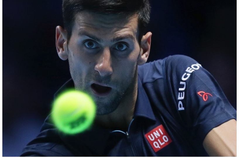
Novak Djokovic

Novak Djokovic's Australian visa was canceled Wednesday after he “failed to provide appropriate evidence to meet the entry requirements to Australia,” the country's border force announced. The tennis star had been stuck in an Australian airport as officials tried to work through issues related to his COVID-19 vaccine exemption for the upcoming Australian Open, Reuters reported.