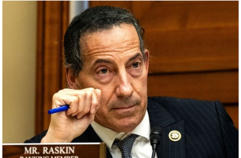
Jamie Raskin

Notably, U.S. Representative Jamie Raskin of Maryland, a leader of the extremist hate-Trump party, is already spreading disinformation about the election, claiming that Trump is rigging it.