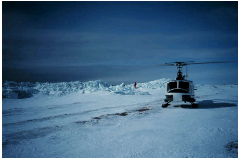
Sea ice piling up on Reindeer Island in Prudhoe Bay area in 1981. Source: National Oceanic and Atmospheric Administration (NOAA).

To get people to believe their propaganda, the climate-change elites tell frightening stories and make scary predictions. In the 1970s this meant that climate-change fanatics told stories about the imminent arrival of a new Ice Age. In its April 28 edition of 1975, Newsweek warned of the dangers of a cooling world.