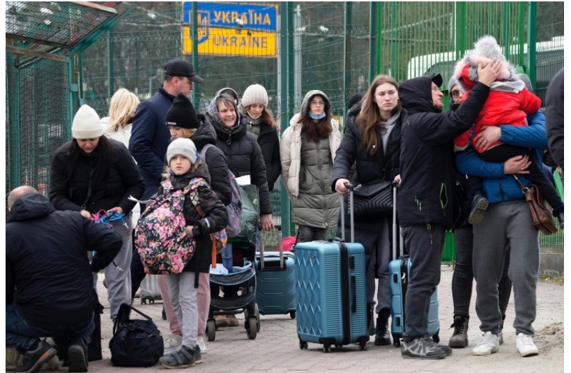
Ukrainians at the border crossing with Poland

"Eligible employees who volunteer for this situation may be selected to serve a temporary duty assignment in Poland to facilitate travelers for entry into the U.S., to include providing