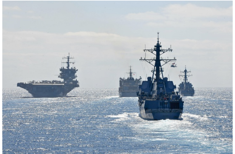
U.S. Navy ships in Mediterranean

Those headlines and dozens like them introduce stories from both conservative and liberal media outlets praising Joe Biden for ordering airstrikes against Houthi interests in Yemen. The Houthis are accused of bedeviling international shipping in the Red Sea.