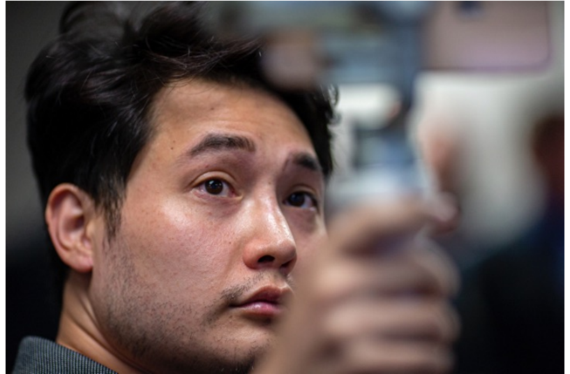
Andy Ngo