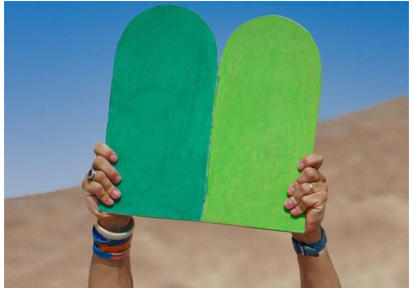
Climate activist Yosef Abramowitz holding new green Ten Commandments